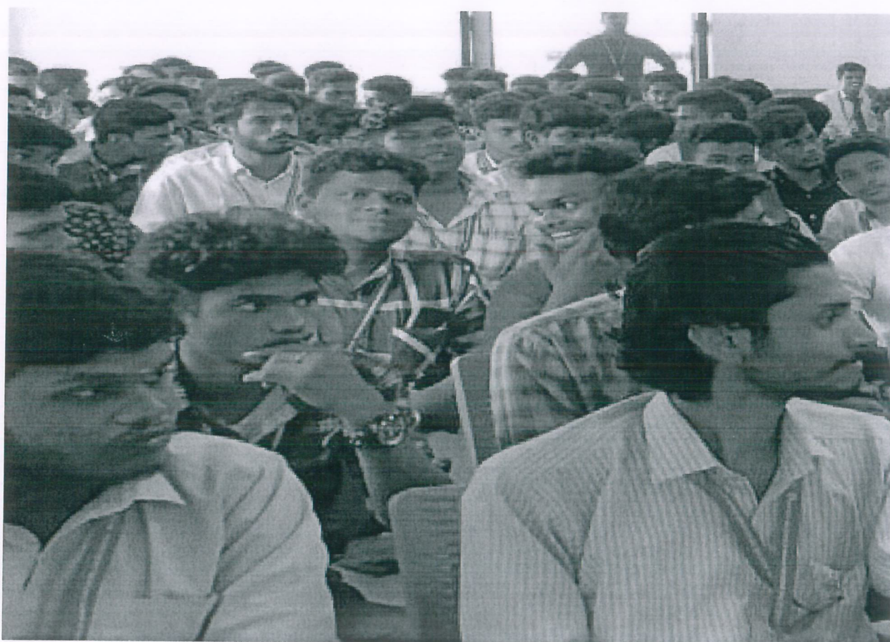
Students are attending Seminar on “BIODIVERSITY AND CONSERVATION”-