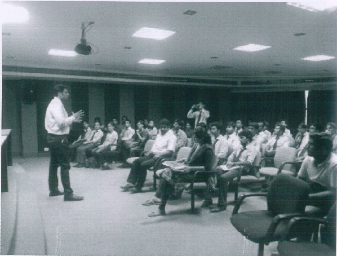
Students are attending a Seminar on Preventing Human Cases during Bird Flu Outbreak on 27.4.2018