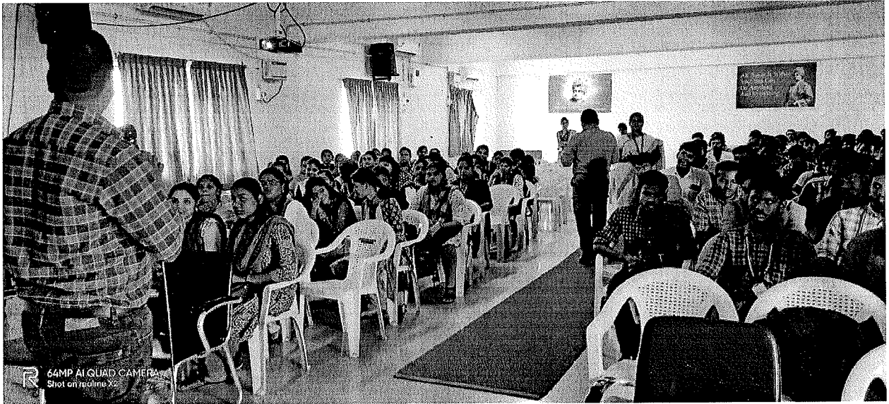
Students are attending a Seminar on Android Application Development

ONE DAY "SEMINAR ON ANDRIOD APPLICATION DEVELOPEMENT" ON 20.9.2016