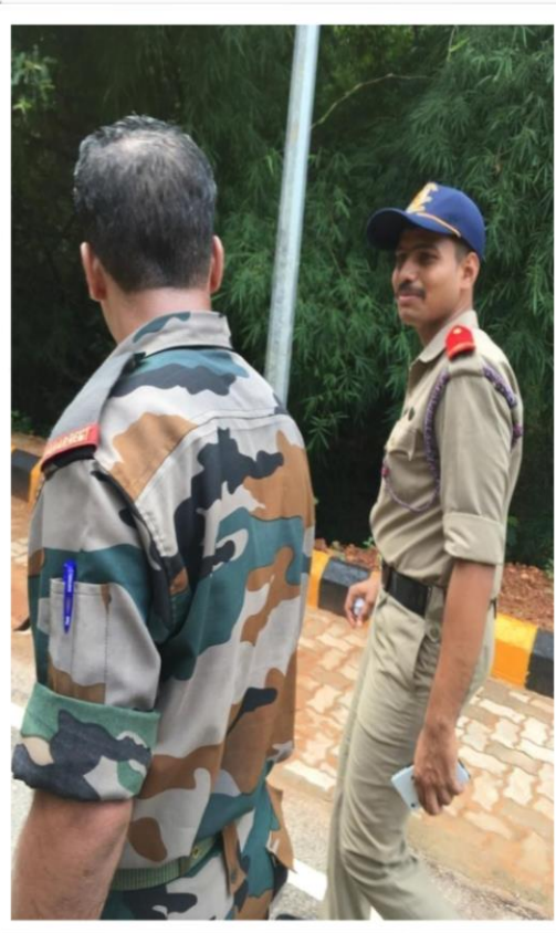
CADETS INTERACTING WITH PERMANENT INSTRUCTIONAL STAFF.