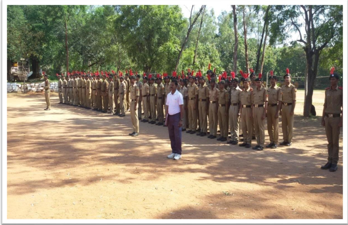
BIHER NCC CADETS WITH OTHER CADETS REPORTING FOR THE PARADE.