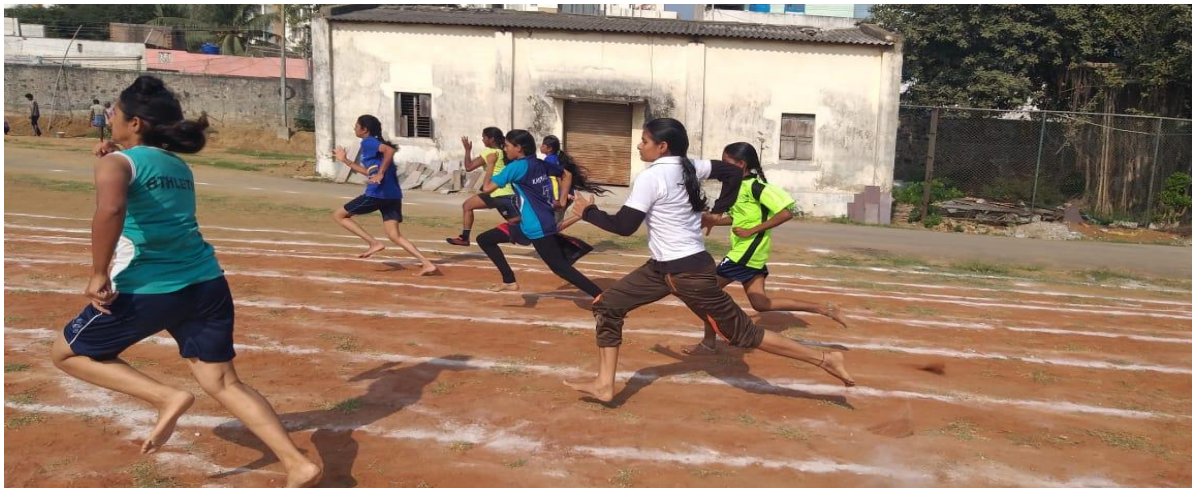
SPORTS DAY CELEBRATION :( 5.4.2018) in University