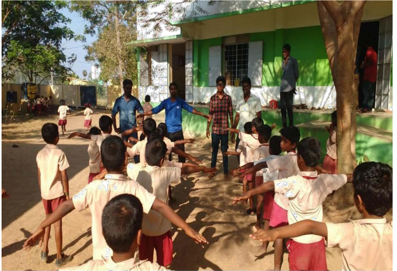
Sports Activities at Venkambakkam School