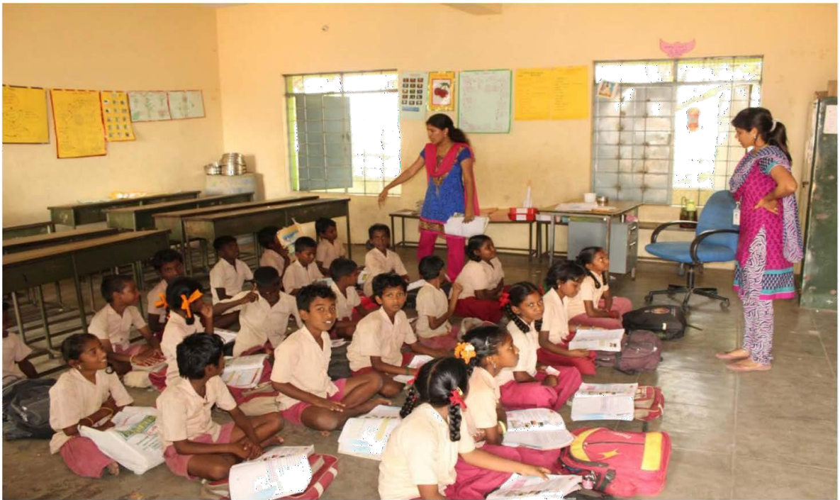
School Soft Skill Development Program at vengampakkam village,kanchipuram district