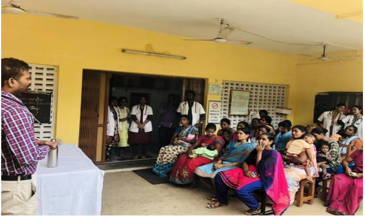
Immunization Awareness Program