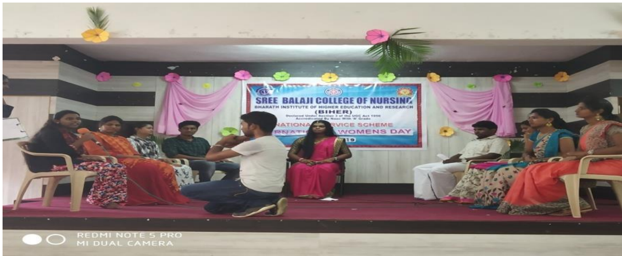
Awareness Day Celebration in Sree Balaji College of Nursing Auditorium (8.3.2017)