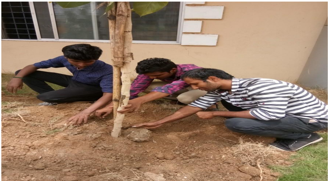
NSS Volunteers planting the trees during the camp