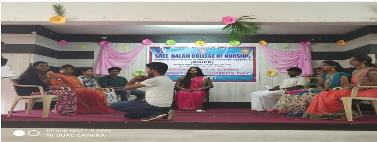
Women's Day Celebration in Sree Balaji College of Nursing Auditorium (8.3.2017)