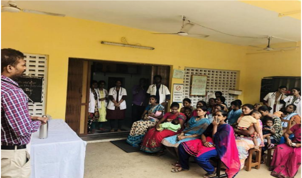
Breast feeding and immunization awareness program