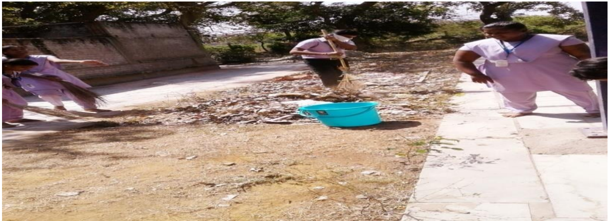
Dengue Awareness Programme (9.8.2016)