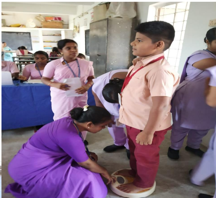
School Health Programme (26.3.2019)