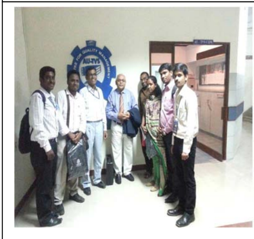
Our I MBA students attended a Workshop on Quality Management at Anna University - 18 & 19.02.15