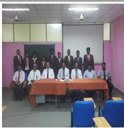
Workshop on "Strategies in Hospital Management" by a Team of Doctors from Sree Balaji Medical College & Hospital on 27.02.15