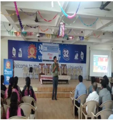
An Orientation Programme on “Earn While You Learn” Programme by Sutherland BPO Services