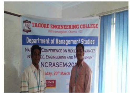
Our Students presented a Paper at Tagore Engineering College on 20.03.15