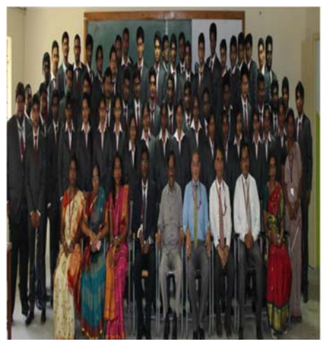
Our I MBA students attended a National Conference at Bangalore on Entrepreneurship Development - 31.01.15