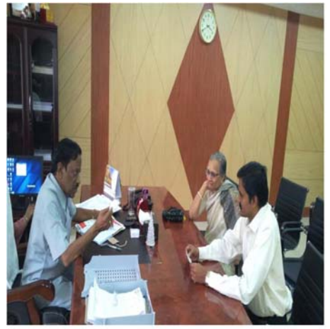
Board of Studies – 09.02.15 - Members of the Board of Studies discussing the reformulation of the Curriculum & Syllabus - Expert Members of the Board of Studies in discussion with our Vice-Chancellor