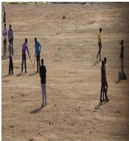
An Intra-Departmental Cricket Tournament christened as “Dr.Sundeeep Aanand Trophy” was organized on 13.04.15