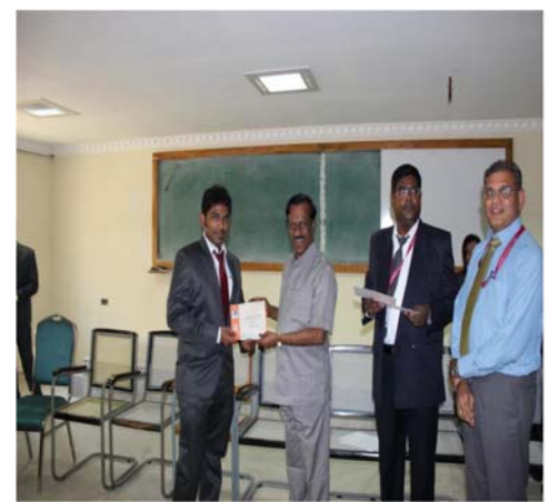
Prizes were distributed for the Intra-Departmental Competitions by our honourable Vice Chancellor