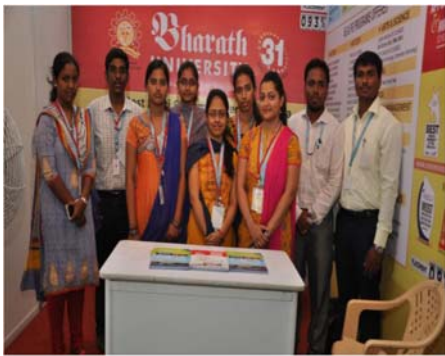
A Promotion Programme at Kamarajar Arrangam organized by Trinity Career Fair on 10.03.15