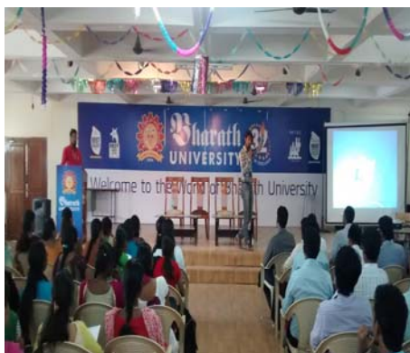
A pre-placement talk by the team from Sensiple Software Ltd on 14.08.15