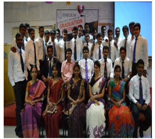
Graduation Day of the Training Programme by EHELIUM