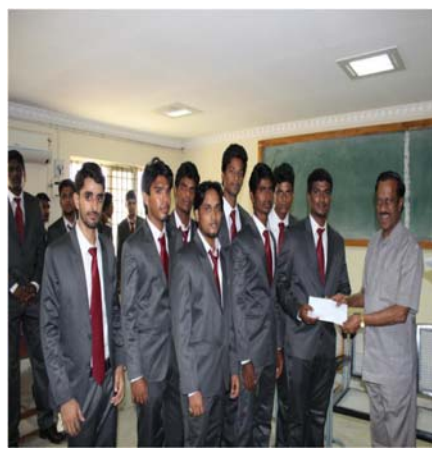
Prizes were distributed for the Intra-Departmental Cricket Tournament christened as “Dr.Sundeep Aanand Trophy” by our honourable Vice Chancellor.