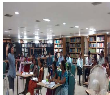
A one Week Faculty Enablement Programme was organized