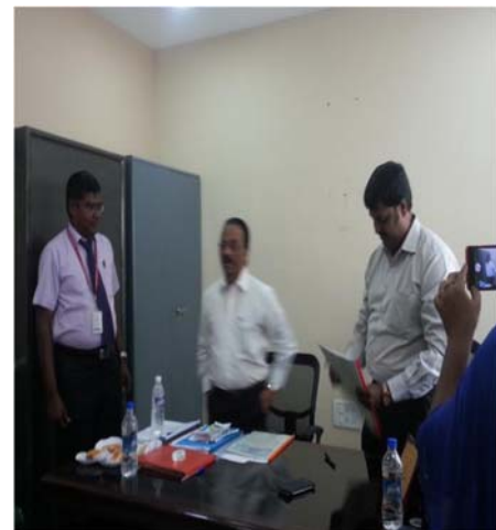
An MoU was signed with Protein Ltd on 22.07.15