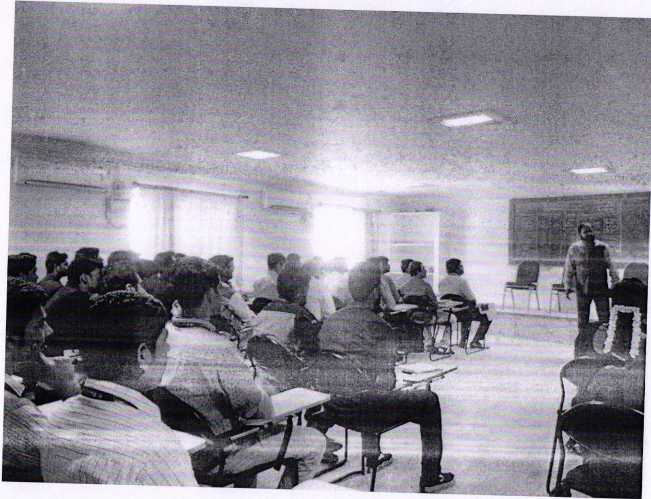
Value added Course: E- Banking on 07/07/2017