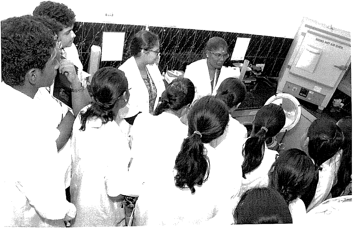
Conducted value added course in Strategic Healthcare Leadership on 5/9/2018