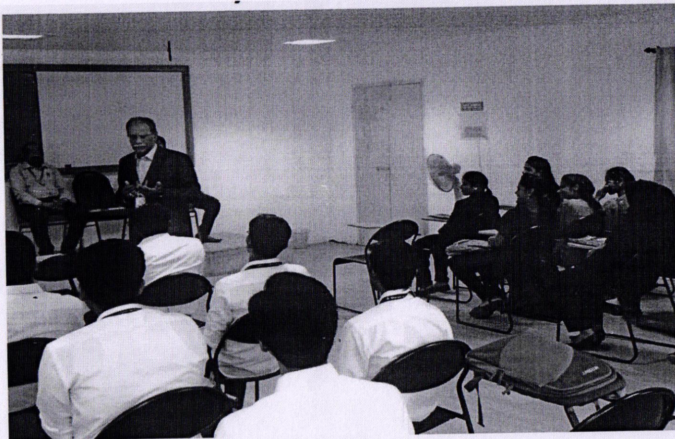
Value added Course: Portfolio Management on 18/01/2018