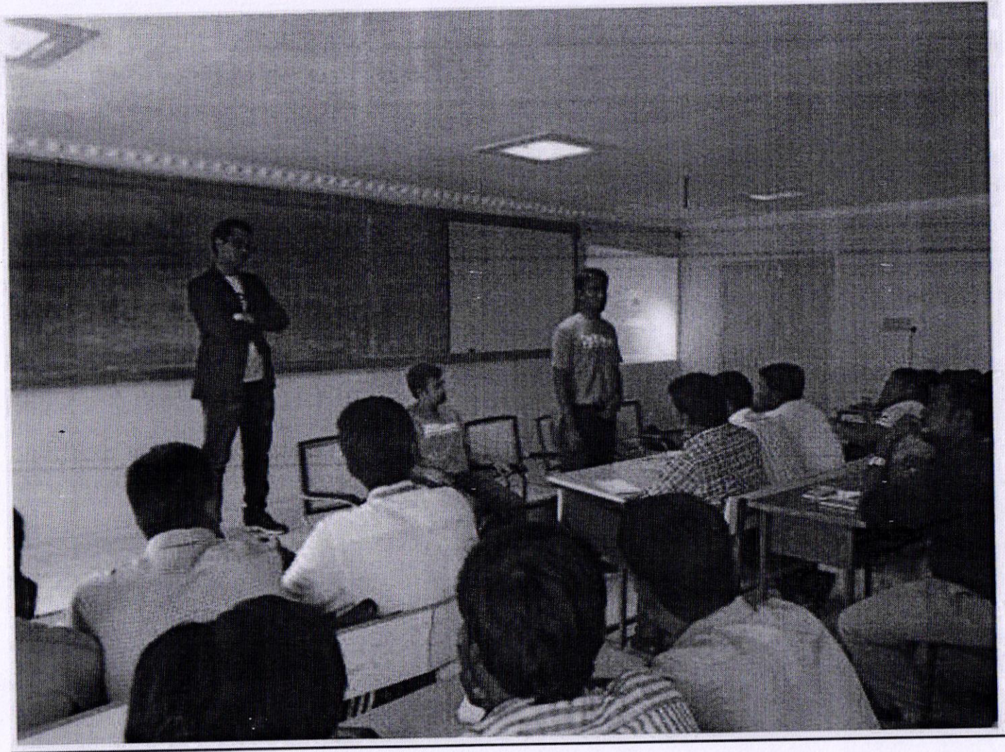
Value Added Course: WLB- a Colloquium on 02/04/2018