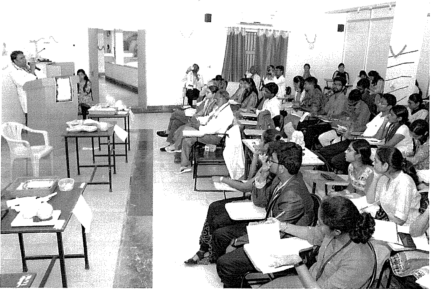
Conducted value added course in Orientation program to Sign Language on 8/8/2017