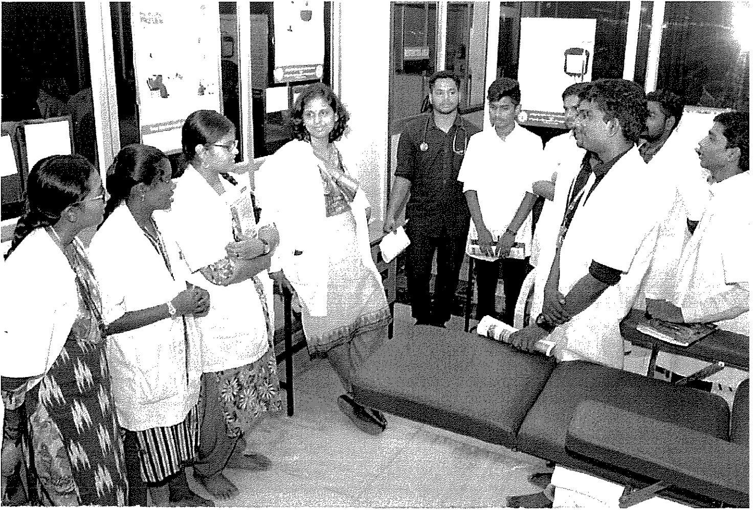
Conducted short term course in Healthcare Trends for Business Professionals, Specialization on 10/26/2017