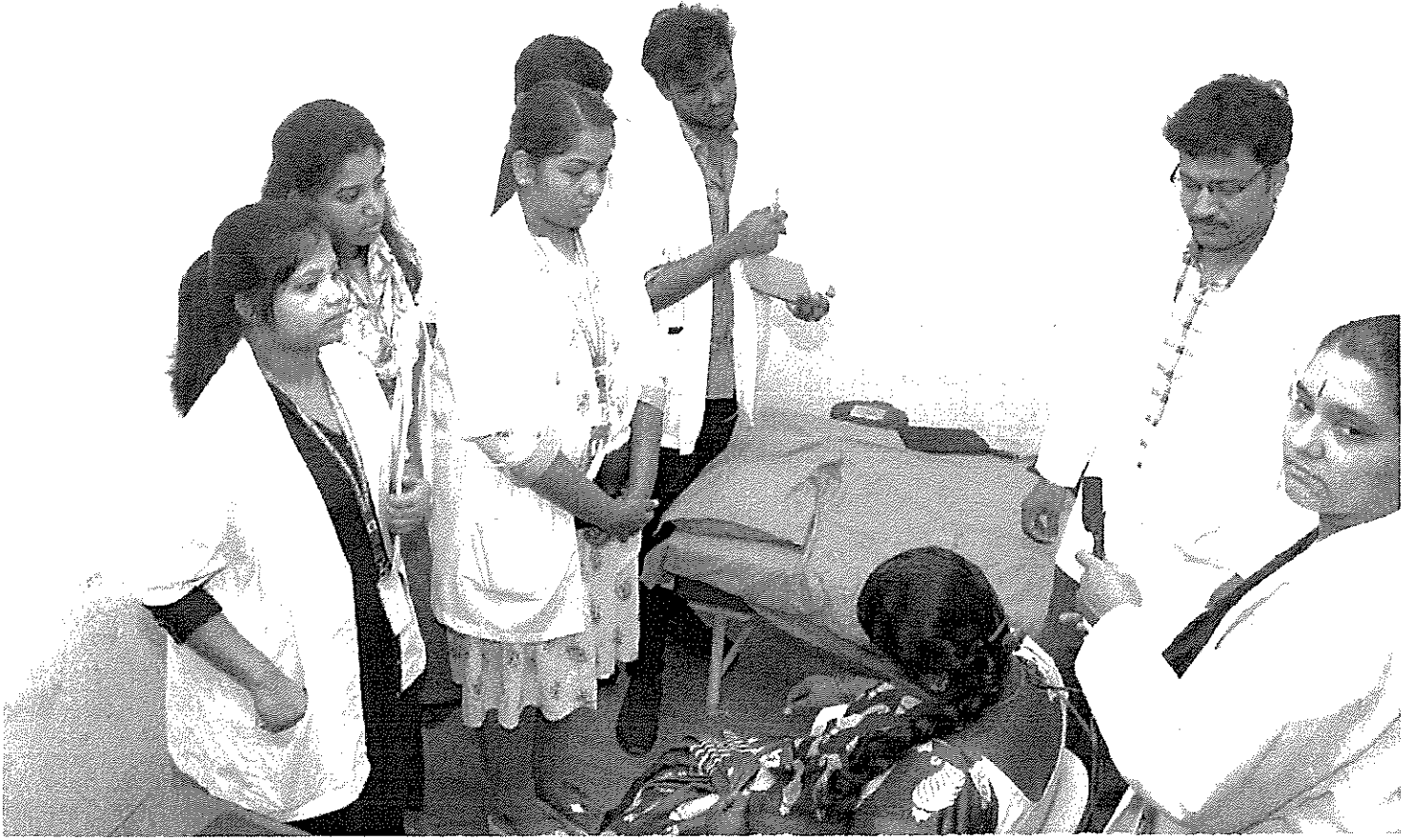
Conducted value added course in The Design and Interpretation of Clinical Trials on 10/26/2017