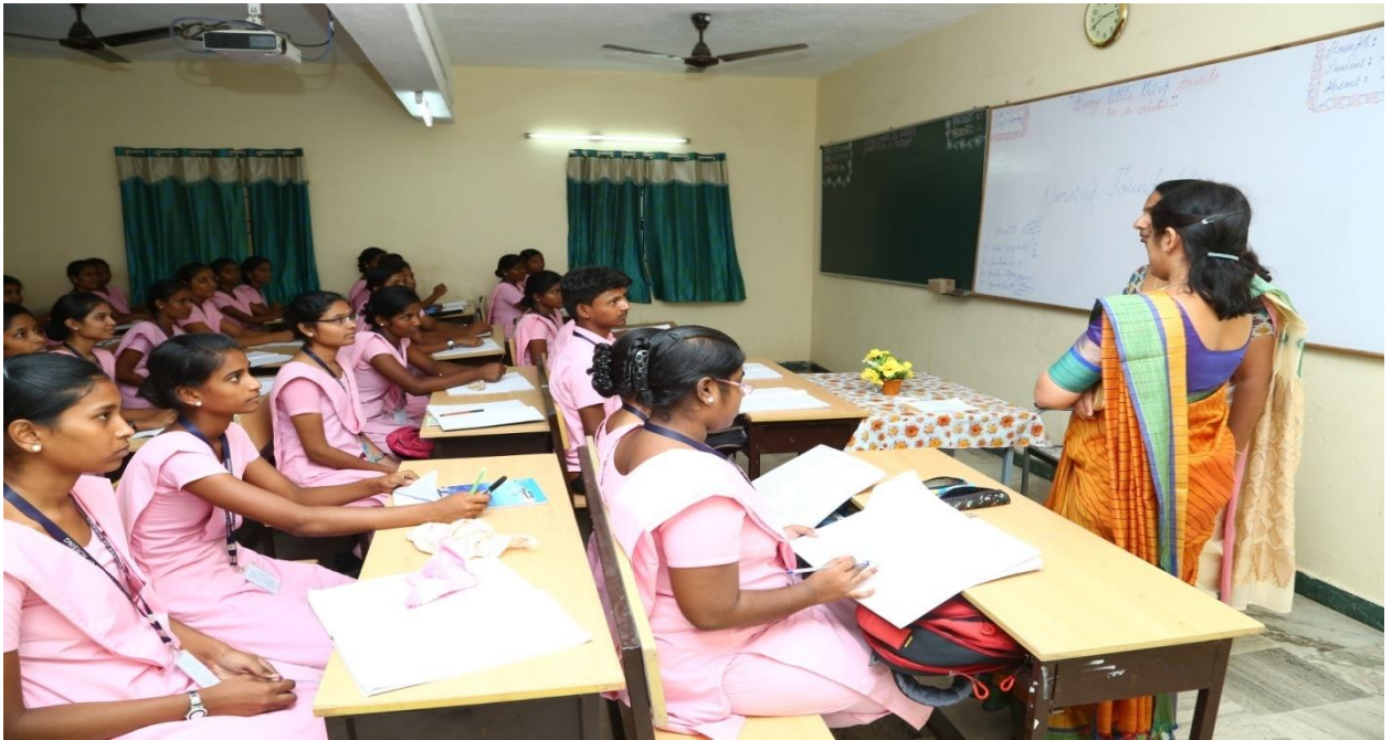
PHOTO GALLERY OF VALUE ADDED COURSES LACTATION MANAGEMENT & COUNSELOR