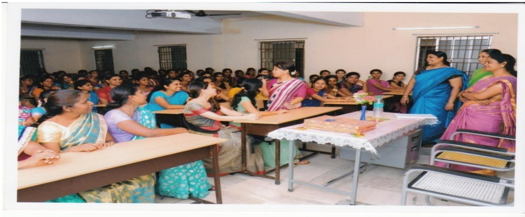
PHOTO COMMUNICATION AND LEADERSHIP SKILLS

The Department of Psychiatric Nursing, school of Nursing, offered a Value added Course on COMMUNICATION AND LEADERSHIP SKILLS 12/06/2019 to 27/06/2019. The participants actively interacted with the speakers.