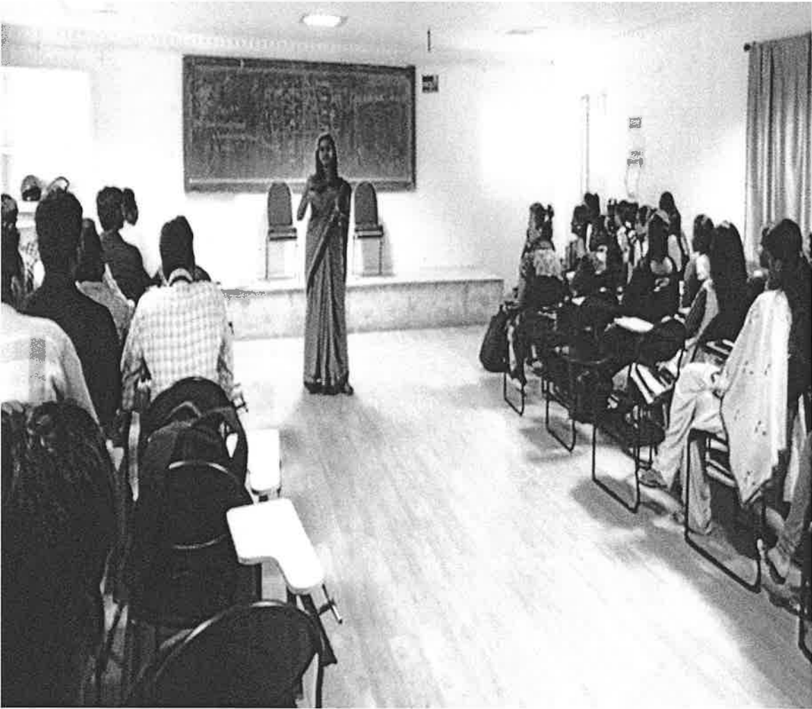
valued added course titled: Short term course on Financial Accounting on 29/07/2019