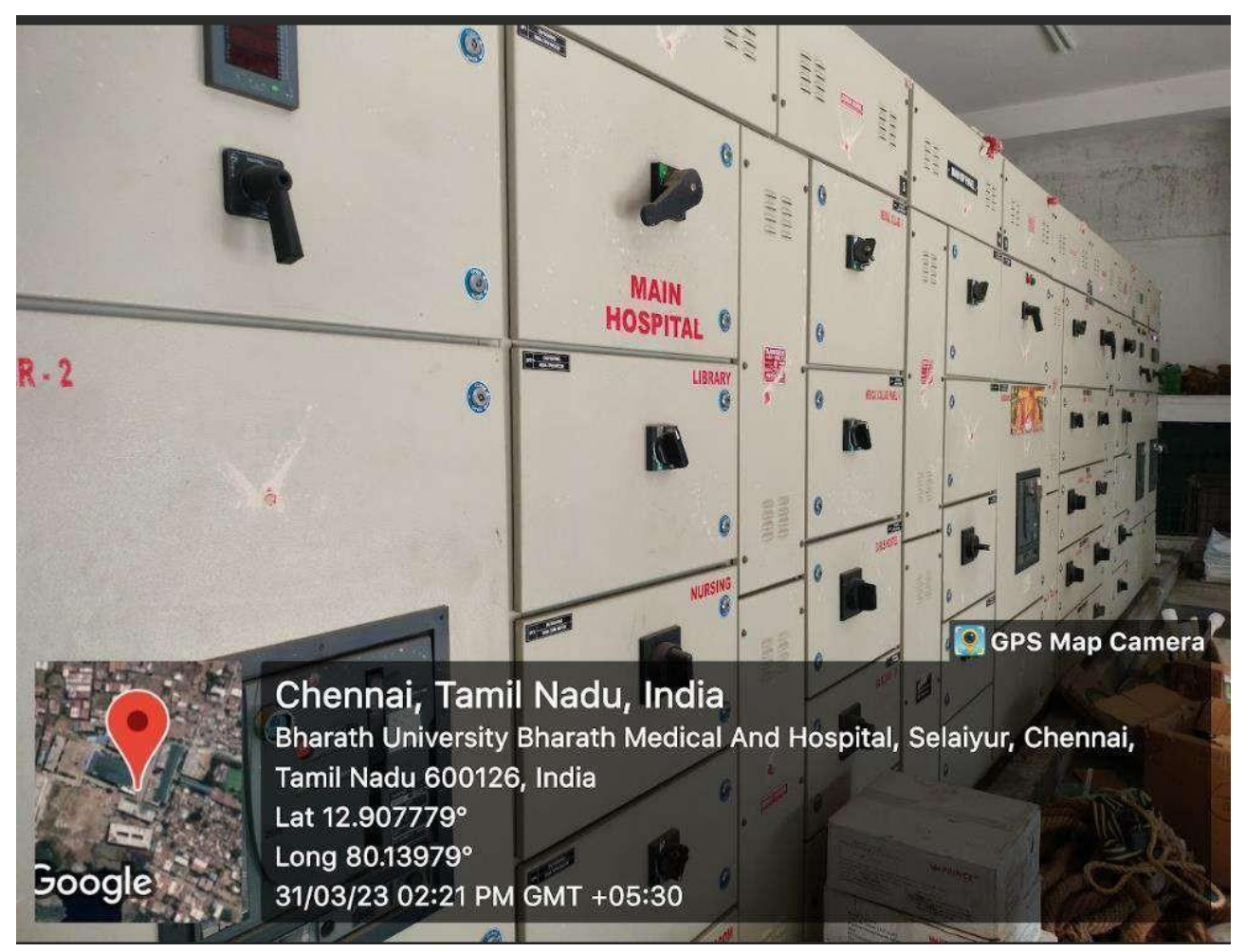
Electrical Panel Room